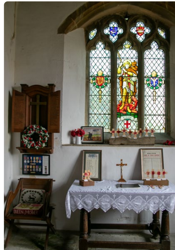
(Right) South Aisle

The parish of Belton with Wardley was formed in 2010, by the merger of the former parish of St Botolph, Wardley, with the parish of St Peter, Belton. The enlarged parish has a population of about 360, of which about 20% are aged under 16 years. Together we make up half of the Uppingham Benefice.