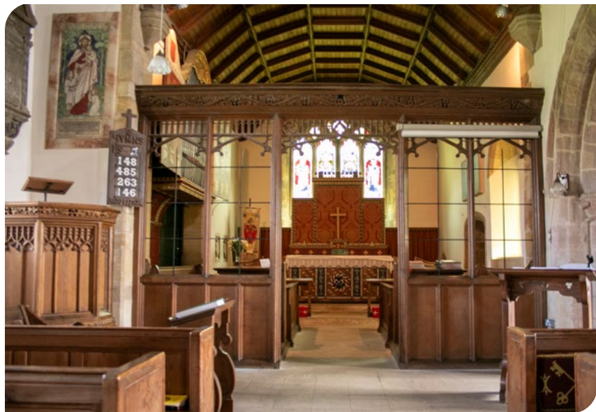
(Left) Chancel of St Peter's, Belton