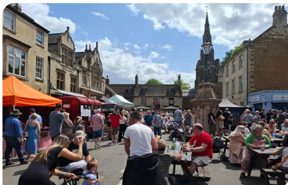
Uppingham's Summer Feast Day