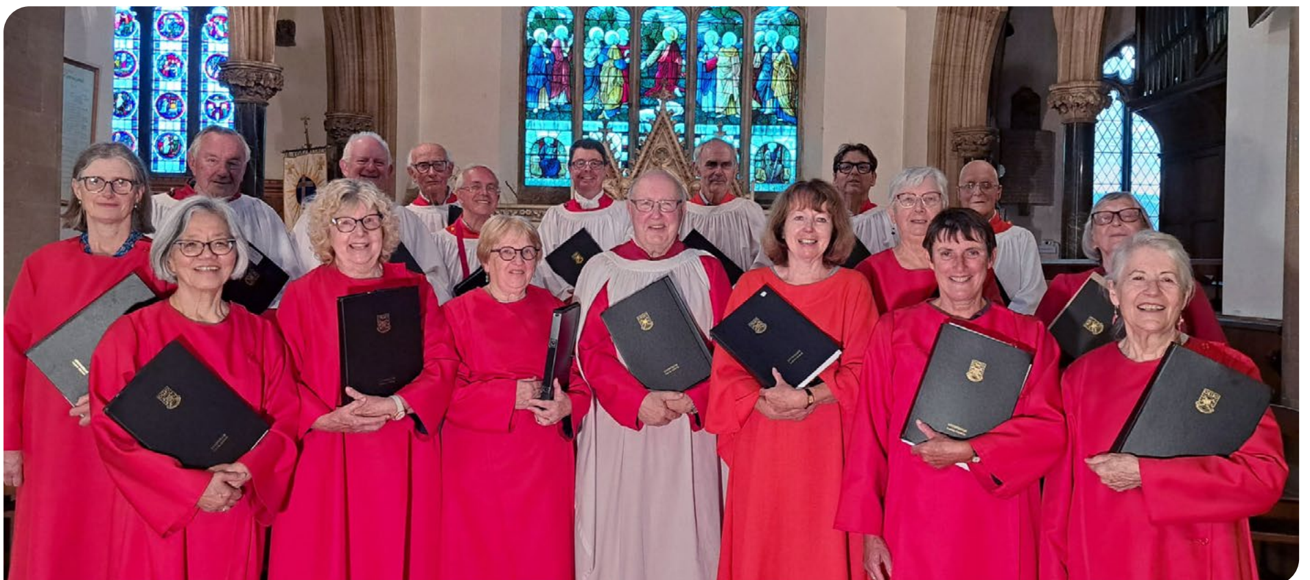
Uppingham Parish Choir