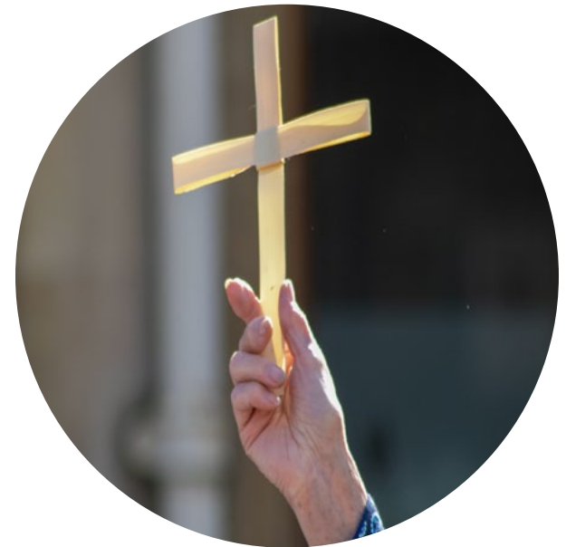
Palm Sunday in Uppingham Market Place